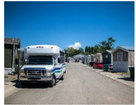
Figure 3. Transportation Provider in Tribal Neighborhood