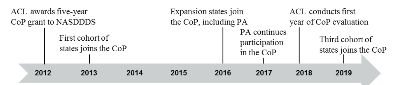
Exhibit 4. Timeline of Pennsylvania's CoP Participation

Using data from the most recent Residential Information Systems Project Report developed by the University of Minnesota, the number of people with I/DD known to or served by the PA Department of Human Services (DHS) in 2016 was 57,517 Long-Term Services and Supports (LTSS) recipients include people with I/DD who receive Medicaid or State-funded supports and services. In 2016, 57% of 57,505 LTSS recipients in PA lived at home with a family member. The report also shows annual Medicaid Waiver expenditures for recipients with I/DD, which amounted to $74,022 per recipient in 2016.<sup>3</sup>